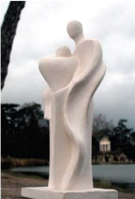
Roi et Reine (King and Queen) – Marble