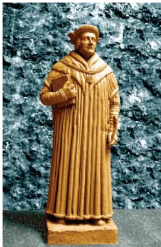
Thomas More – Study in glass