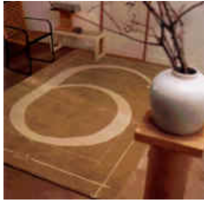
Building six Carpet Size: 170 x 270