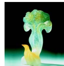
The Lyre Bird