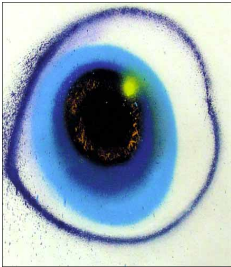
Aerosol on paper Date created: 2004 Size: 60 cm x 45 cm