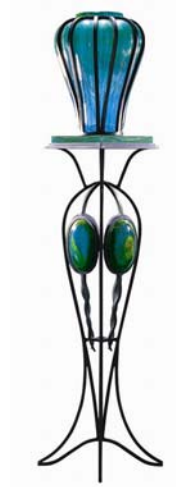
Shanghai vase – 75 copies