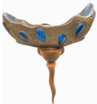
Lacrima blue wall lamp

In 1990 André Dubreuil designed a number of prestige pieces such as "Shangai", "Macao" and "Chantilly", together with the "Lacrima" collection where crystal tears seem to rise up out of hammered flat gold plates. Dubreuil plays with swirls, curves and counter-curves, ovals and views from below. He dilates or shrinks space, imprisoning the magic of glass in the rhythm of metal. Halfway between tension and vertigo, he rediscovers a Baroque splendour and exaggeration, making play with the power of seduction.