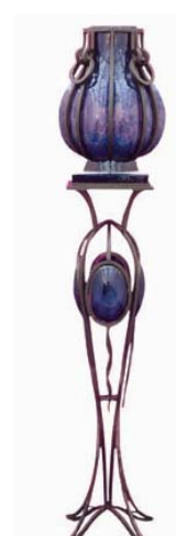
Macao Vase – 75 copies