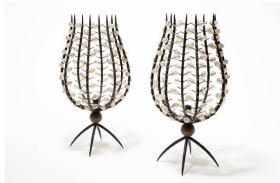
Pair of "Fleur" Bronze Created in 1989 Dimensions: 61 x 31.8 x 31.8 cm