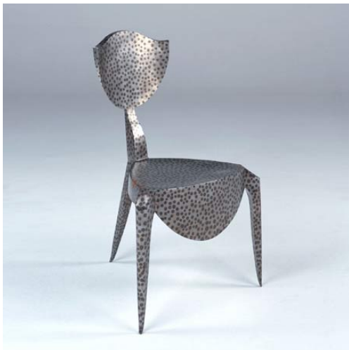
Paris Chair Metal Created in 1988 Height: 93 cm