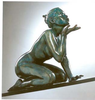
Le Baiser (The Kiss)