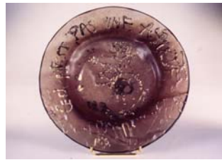
Ceci n'est pas une assiette