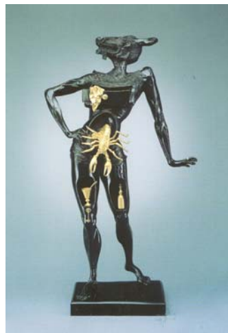
The Minotaur Sculpture in bronze - Mythology 1989 Height: 45 cm