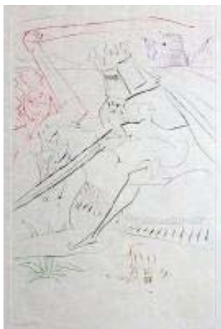
Quest for the Grail: Black Knight Engraving 1975 Paper: 66 x 50 cm – Image: 40 x 26 cm