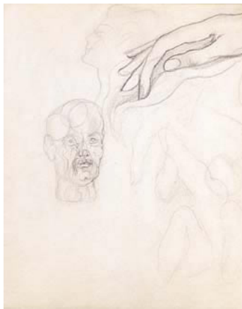
Composition c.1934 Graphite Size: 19 x 15 cm