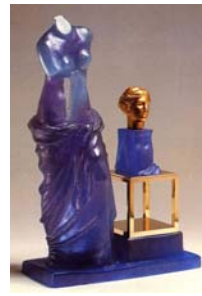
Le désir Hyperrationnel