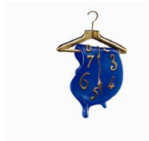
La Montre molle