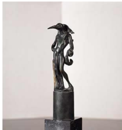
Bird Man, Bronze Multiple in bronze with black patina Height: 25 cm