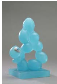
Œil de Pâques