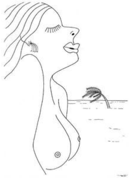
Eleuthera - Drawing Date created: 2005