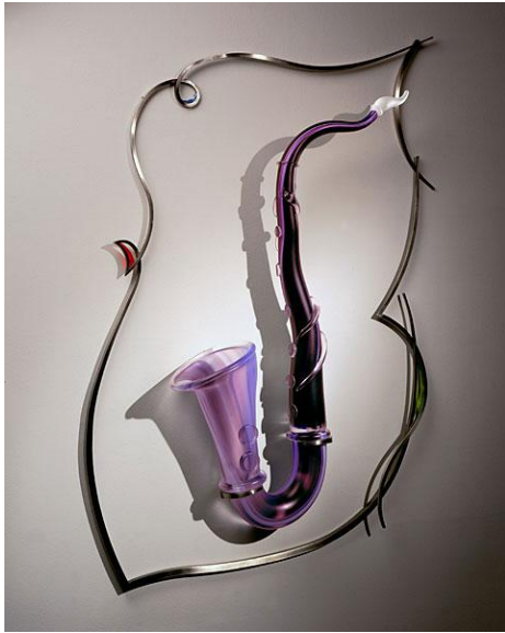
Wistful Date created: 2003